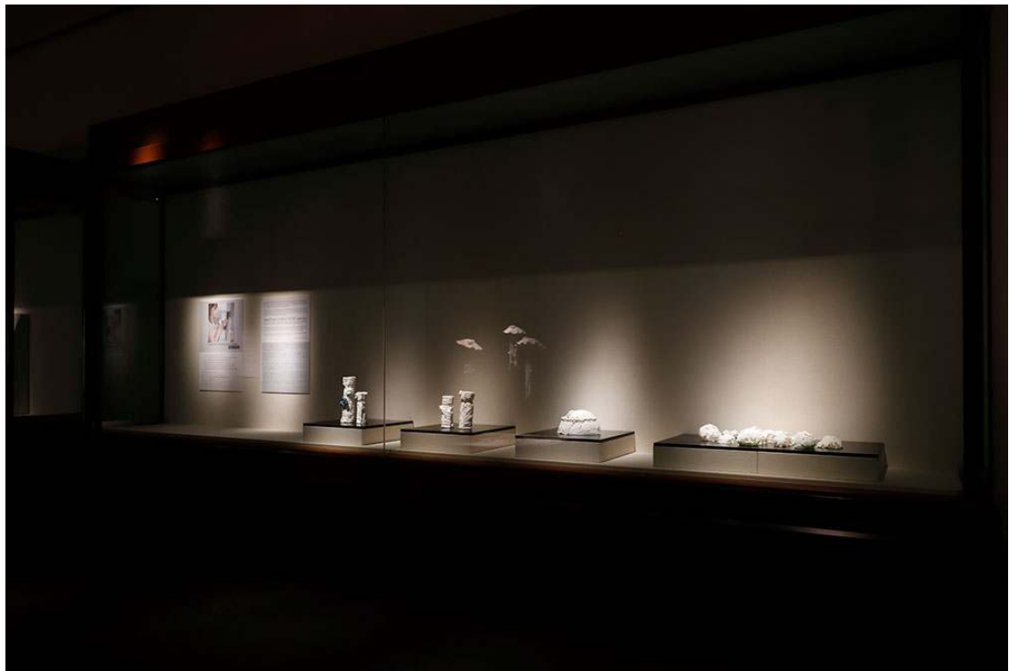
Seto City Art Museum Seto, Japan