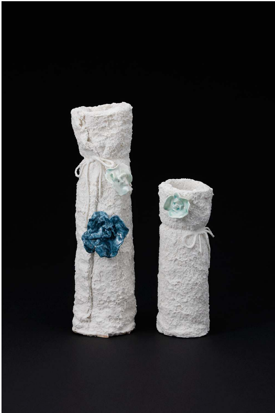
TSUBAKI BOUQUET New Bonne Porcelain H. 30,2 cm / 20,5 cm 2019