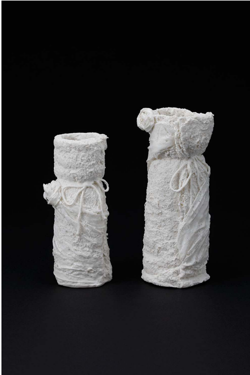
CORAL BOUQUET New Bonne Porcelain H. 22,7 cm / 19 cm 2019