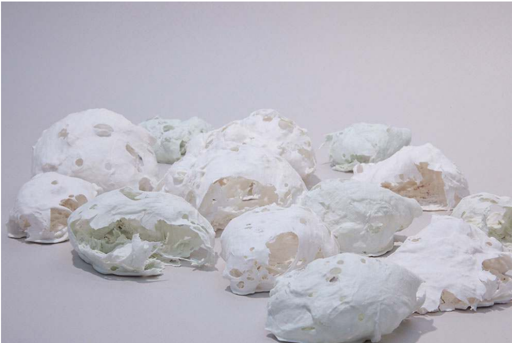
SEA STONES Porcelain W. 85 cm 2019